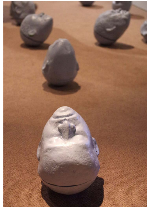
4) Patricia Belli, Desequilibradas , 2018, Detail