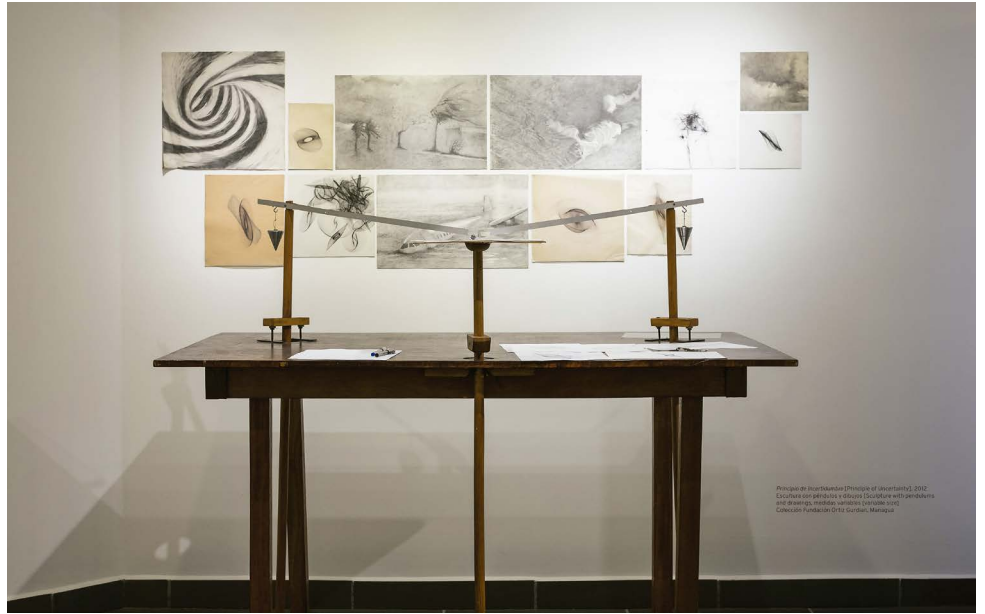
5) Patricia Belli, Principio de incertidumbre , 2012