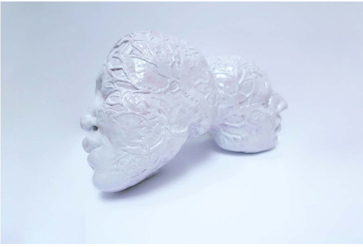
3) Patricia Belli, Roots , 2019